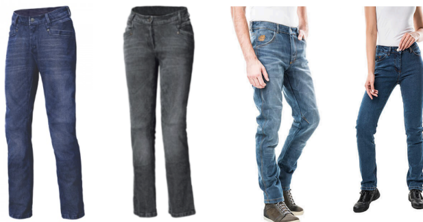
Held and Motto Wear