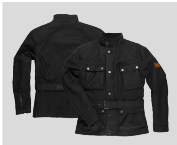
The Rokker Company